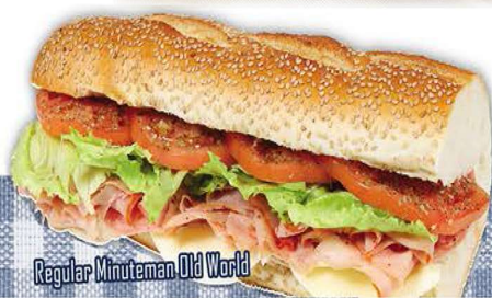
Regular Minuteman Old World